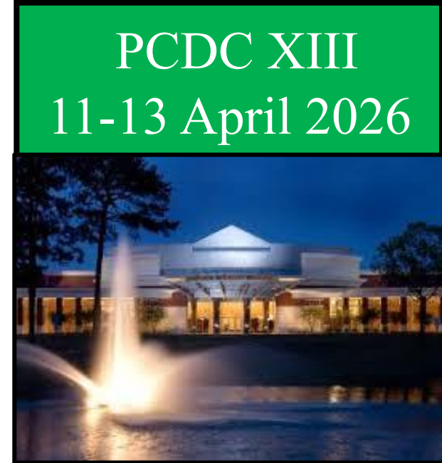
Trident Technical College